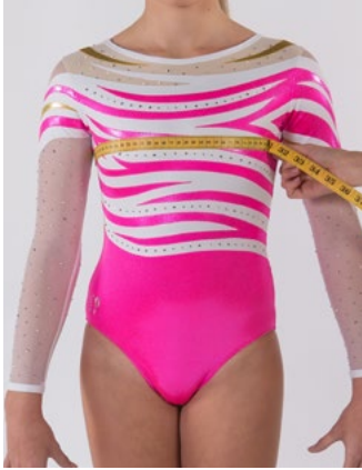
CHEST With arms by side, measure around the fullest part of chest.

The aim of measuring your athlete is to find the most appropriate size based on the size chart below. Please ensure that athletes are wearing fitted apparel during the measuring process.