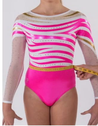
WAIST Measure around waist at navel.