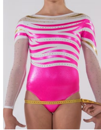
HIP Measure around the fullest part of buttocks.